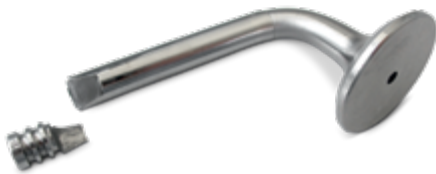
Fig. 1: forced breakage at groove

Frequently, after a repair to a cylinder head, valve breakage occurs in the area of the valve cotters (Fig. 1) after a short running time. Valves with a stem diameter of 7 mm or less are especially prone to this problem.