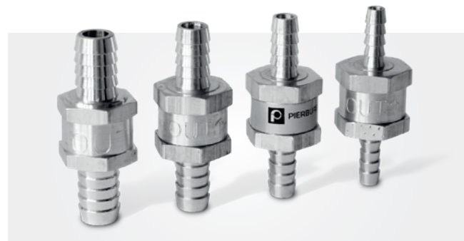
Fuel check valves 6 – 12 mm

Take care not to use material combinations that can lead to corrosion or contact corrosion when used with aluminium, e.g. salt water or galvanised surfaces.