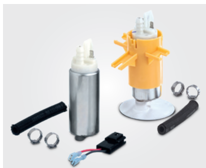
If required, the necessary auxiliaries are included with the spare parts kits