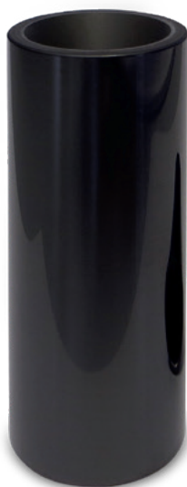
Fig. 1: Piston pin with DLC coating

The DLC coating is applied with a PVD (Physical Vapour Deposition process) procedure. In engine manufacturing, the PVD process has been used for more than 20 years for coating sputter bearings.