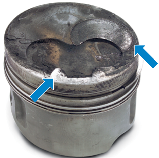
Fig. 4: impact marks due to engine overheating