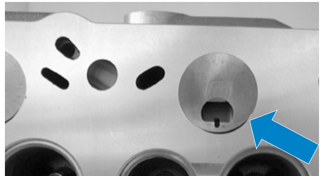
Fig. 1: cylinder head with installed swirl chamber inserts

Cylinder head problems in swirl chamber engines mostly arise in the form of engine overheating, as a result of incorrect cylinder head repair or handling. Some frequently asked questions are answered below.